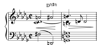
Ex. 2.2 Dominant chord with augmented fifth in Chopin’s Piano Sonata No. 2 in B flat minor Op. 35

Inner voice chromatic movement has been a common feature of European classical music for centuries, from the interweaving lines of Renaissance polyphony and the chains of suspensions in the music of Bach to the saturated harmony of Wagner and early Schoenberg, but this study aims to identify only specific references that foreshadow Jobim’s idiosyncratic |iii13 iii7#5|vi9-vi7(b9)| progression. The first reference (Ex. 2.2) comes from Chopin, whose music Jobim studied intensively and admired deeply.