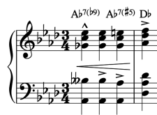
Ex. 2.3 Complex passing chords in Chopin’s Nocturne, Op. 15 No.1

seventh chord with an augmented fifth, the same 7(#5) voicing that appears in the second chord of Jobim’s trademark progression. More harmonically adventurous than the passing chords and suspensions that preceded it in European classical music, it is often referred to as the “Chopin chord”, another example of which can be found in Nocturne, Op. 15 No.1 .