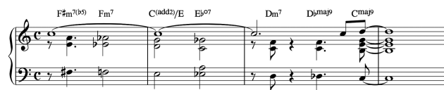
Ex. 1.6 "Flat 5" jazz ending with descending chromatic bass line

This progression is also a stock jazz ending, referred to as a "Flat 5" 10 , in which the solo instrument or singer holds the tonic over a descending chromatic accompaniment from #IVm7b5 to Imaj7.