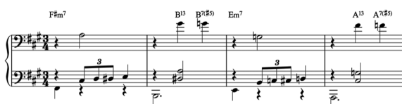
Ex. 2.4 Inner voice chromaticism in Ravel’s Feria from Rapsodie Espagnole (piano reduction)

The prominent two-note descending chromatic figure in the modéré section of the final movement Feria foreshadows the |13-7#5| figure in Jobim’s trademark harmonic progression.